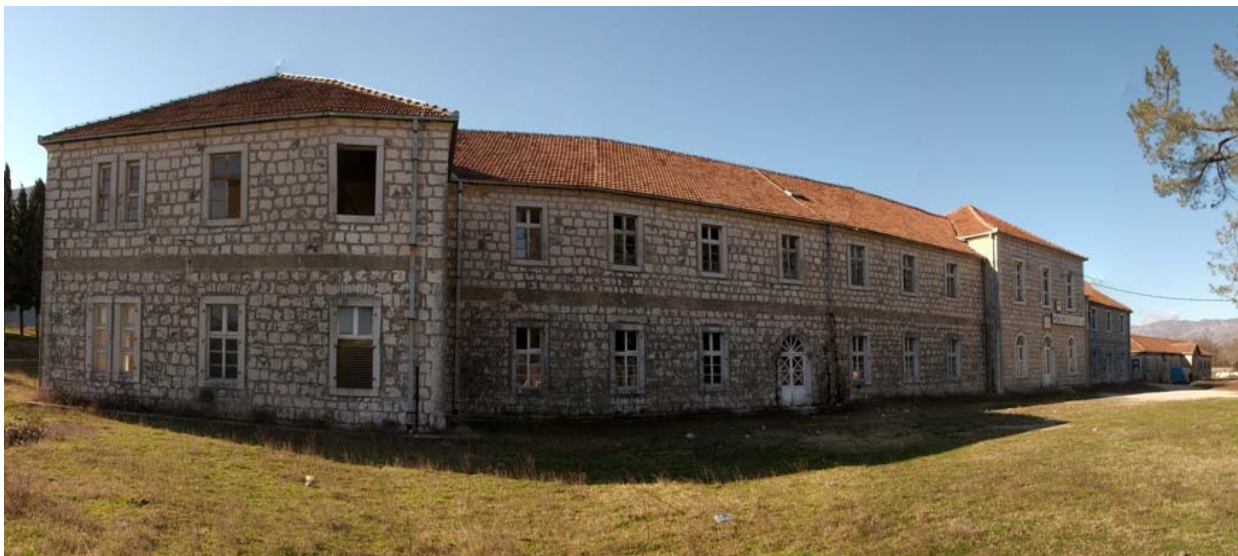
View of the site before the reconstruction