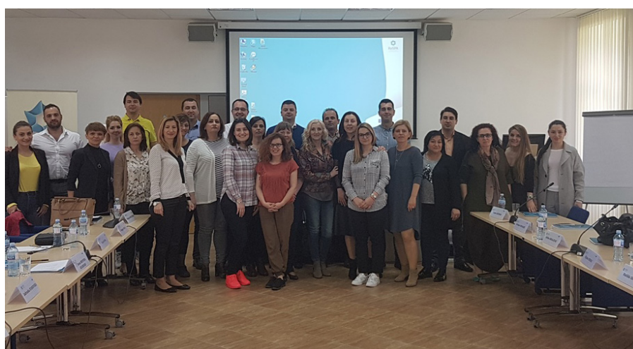
Participants in the ReSPA Training on Legal Alignment for Chapters 11 and 12

ReSPA, Danilovgrad, 11-13 April 2018 – With an aim to contribute to stronger administrative capacities for harmonisation of national legislations with the EU Acquis, ReSPA organised a training on legal alignment for 24 civil servants from the Western Balkans' administrations in charge of negotiating Chapter 11 – Agriculture and rural development, and/or Chapter 12 – Food safety, veterinary and phytosanitary policy. The training enabled extensive elaboration of the two chapters, and focused on examples of legal transposition and preparations of candidate countries for negotiations related to these chapters.