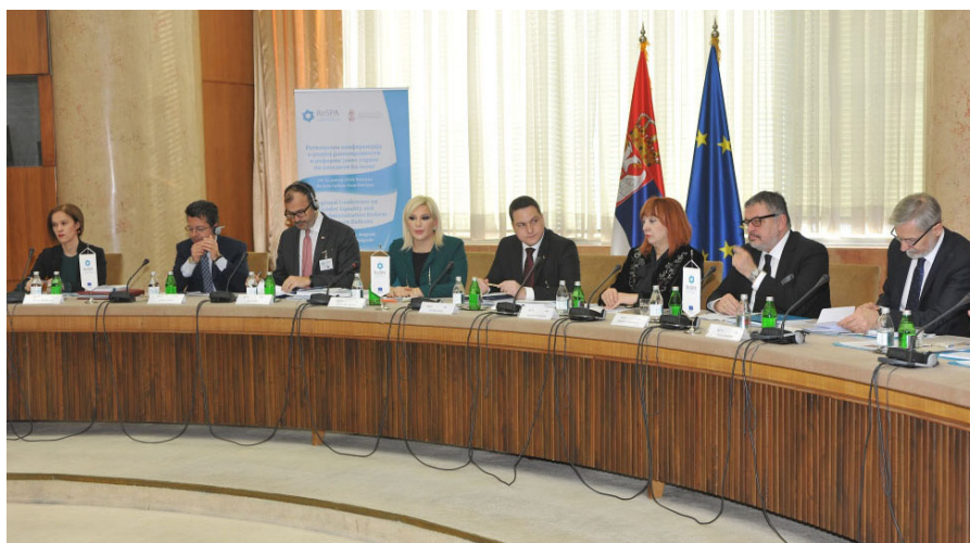
High-level speakers at the Regional Conference on Gender Equality and PAR

This Regional Conference brought together more than 50 public servants dealing with gender equality and PAR in 30 different governmental institutions, experts on gender equality and PAR from the Western Balkans region, and representatives of non-governmental organisations active in this field from Bosnia and Herzegovina, Montenegro and Serbia.