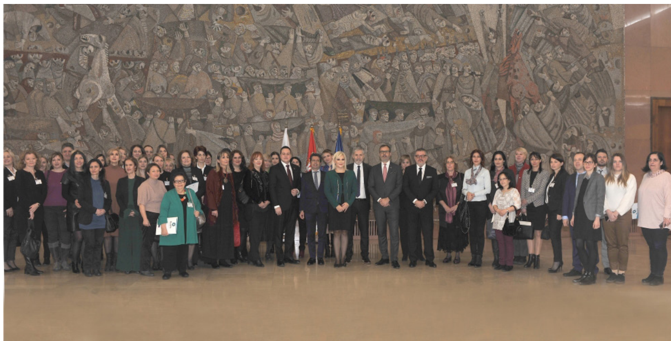
Photo 14A – Participants of the Regional Conference on Gender Equality and PAR

gender equality in the context of public administration reform.