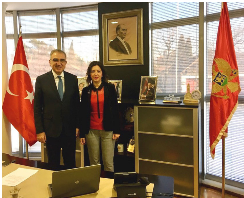
Ambassador of Turkey with ReSPA Director