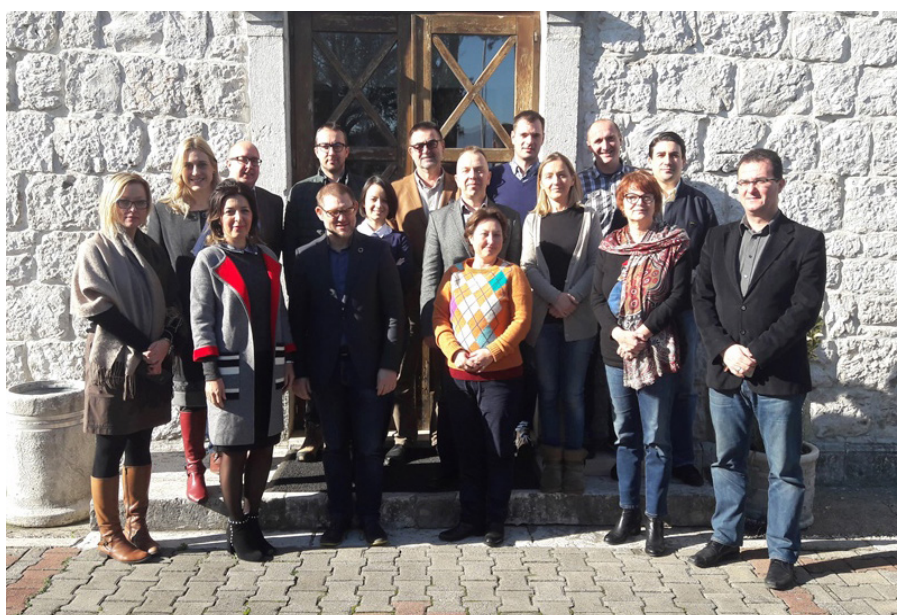
ReSPA Secretariat with CAF experts

The CAF internal training is part of the preparations for establishing of the Regional Quality Management Centre in ReSPA. Also, the ReSPA team will use CAF as one of the Quality Management tools to enhance its daily operations.