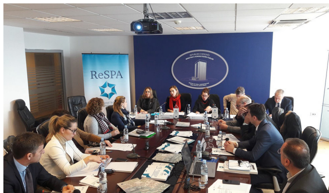
Focus Group in Pristina

ments by analysing existing policy frameworks, rethinking of strategic options for service delivery models, and exploring various approaches to user satisfaction measurement.