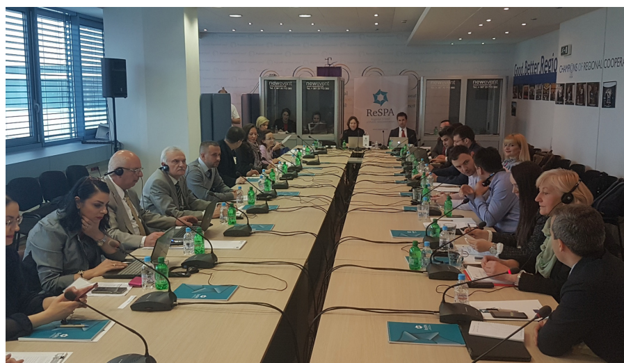
Participants of the Regional Meeting on Better Regulation in Western Balkans

Sarajevo, 18-19 April 2018 – In cooperation with the Regional Cooperation Council (RCC), ReSPA organised a two-day meeting on Better Regulation efforts in the Western Balkans. Participants of the meeting were 20 senior public servants dealing with the oversight of Regulatory Impact Assessment (RIA) and other aspects of Better Regulation in governmental institutions of ReSPA Members and Kosovo*.