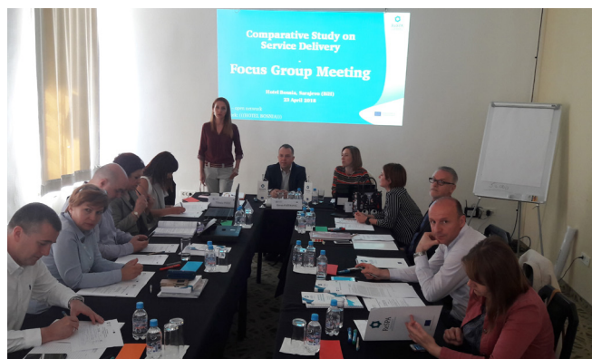
Focus Group in Sarajevo