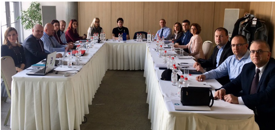
Delegation from Bosnia and Herzegovina with their hosts in Belgrade

trative Procedure Act (GAPA) of the Republic of Serbia and to eventually replicate some legal solutions in BiH.