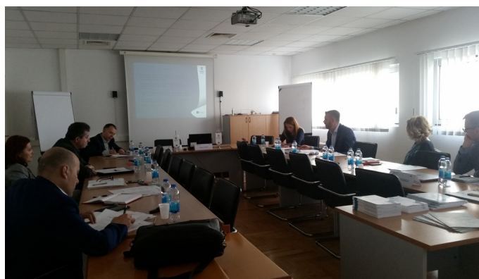
Focus Group in Banja Luka

In the following period, all country profiles will be finalised encompassing data mining, semi-structured interviews, and results of focus groups and online questionnaires. Further validation of findings is to be conducted in the upcoming period in collaboration with the stakeholders.