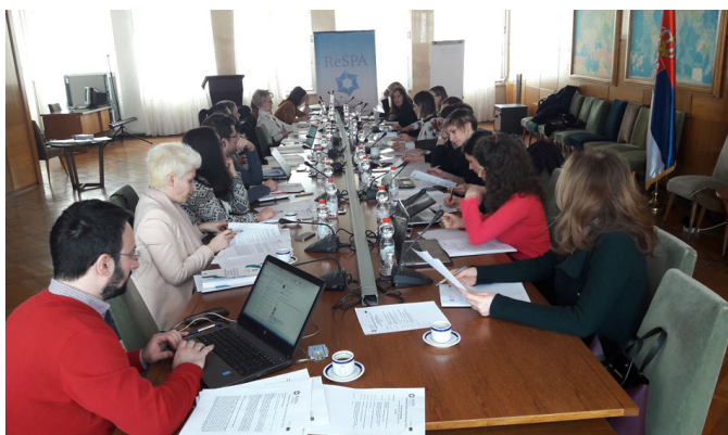
Focus Group in Belgrade