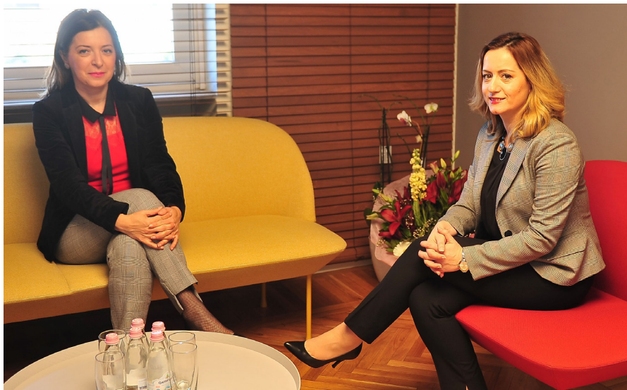
Meeting of ReSPA Director with Deputy Prime Minister of the Republic of Albania