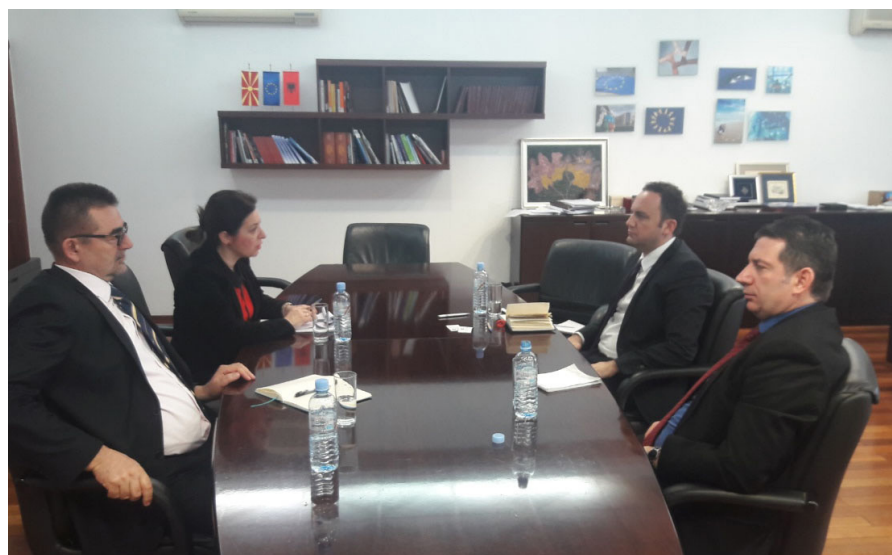
Meeting of ReSPA representatives with Deputy Prime Minister of the Republic of Macedonia