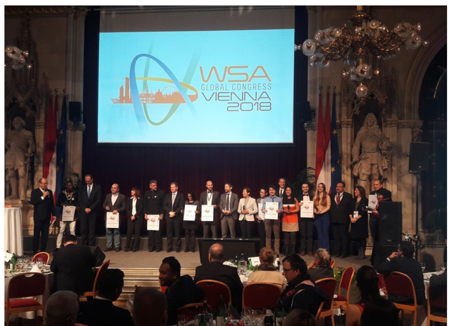
World Summit Awards ceremony in Austria

Vienna, 20-22 March 2018 – Initiated in the framework of the UN World Summit on the Information Society (UN WSIS) in 2003, with more than 180 countries actively involved, the World Summit Awards (WSA) is a unique awards system, a global hub for selecting and promoting local digital innovation with high impact on improving society. Combining international events and activities with a global network of start-ups, social entrepreneurs, mentors, assessors, speakers, experts, government leaders, representatives of academia and civil society, the WSA is an international platform for cut edge examples on how ICT can have an impact on society and contribute to the UN Sustainable Development Goals Agenda.