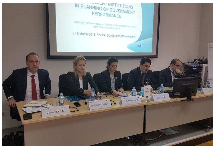
Speakers at the Meeting of representatives of CoG Institutions

ReSPA, Danilovgrad, 5-6 March 2018 - The Meeting of representatives of Centre of Government (CoG) institutions gathered officials from CoG institutions and representatives of institutions responsible for the EU integration process from Western Balkan countries. The objective of the Meeting was to give an opportunity to participants to highlight similarities and differences in the experiences from the Western Balkans region, and to discuss concrete possibilities for a better linkage of govern-