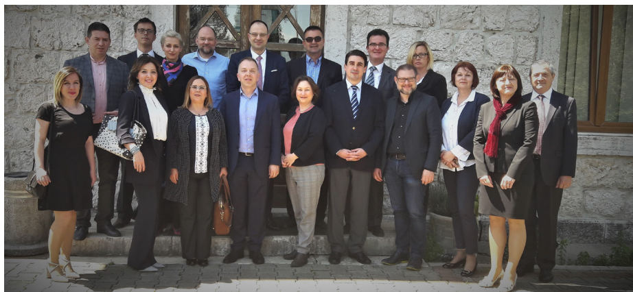
ReSPA Advisory Board members, Governing Board at Senior Officials' level members and ReSPA Secretariat

The meeting of the ReSPA Governing Board at Senior Officials' level and the Advisory Board was concluded with a proposal for ReSPA Secretariat to make a preselection of indicators and sub-indicators based on the experience and achievements in identified key areas of work. The upgraded draft of the strategic document will be considered and