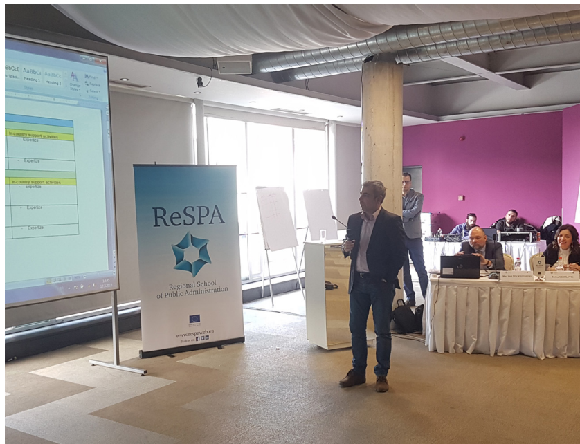
Participants of the Workshop on Strategy Development in Belgrade

Belgrade, 12-13 March 2018 – For the first time since its inception, the Regional School of Public Administration (ReSPA) has convened key stakeholders for the purpose of strategic planning. The Workshop on Strategy Development gathered around 80 participants from ReSPA Members and Kosovo *1 ; Governing Board members at Senior Officials' level, members of all ReSPA Working groups 2 , and National Coordinators.