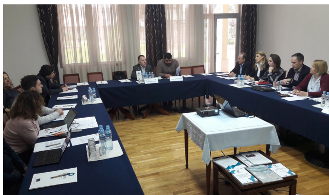
Focus Group in Skopje

ment of implementation of new general administrative procedures, interoperability and measurement of client satisfaction - were among the most triggered questions and comments.