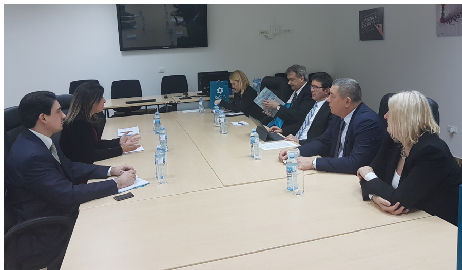
Meeting in ReSPA with delegation from Slovenia