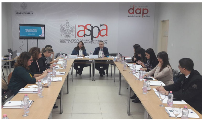
Focus Group in Tirana

participants contributed to the formalisation and shaping of the future Study's most important ele-