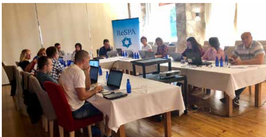
ReSPA Secretariat at the Workshop on Strategic Planning

Kolasin, Montenegro 22-24 August 2018 – ReSPA Secretariat held a Workshop for planning of activities for the period until the end of 2018. The period from September to December 2018 will be marked with a number of activities: regional conferences, seminars, workshops, peer-missions, meetings, and completion of several regional comparative studies. ReSPA's current grant from the European Commission will be finished in December this year, and therefore the plan of activities will coincide with the duration of the grant. ReSPA is currently developing its Strategy for the period 2019-2024, and the first day of the Workshop in Kolasin was dedicated to the discussion about the Draft Strategy. Also, the Secretariat made a detailed plan for consultations about