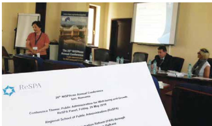
ReSPA panel at the 2018 NISPAcee Annual Conference

As a NISPAcee's partner, ReSPA organised a panel session on supporting public administration reform (PAR) in the Western Balkans through regional cooperation. In addition to the presentation of ReSPA's achievements and