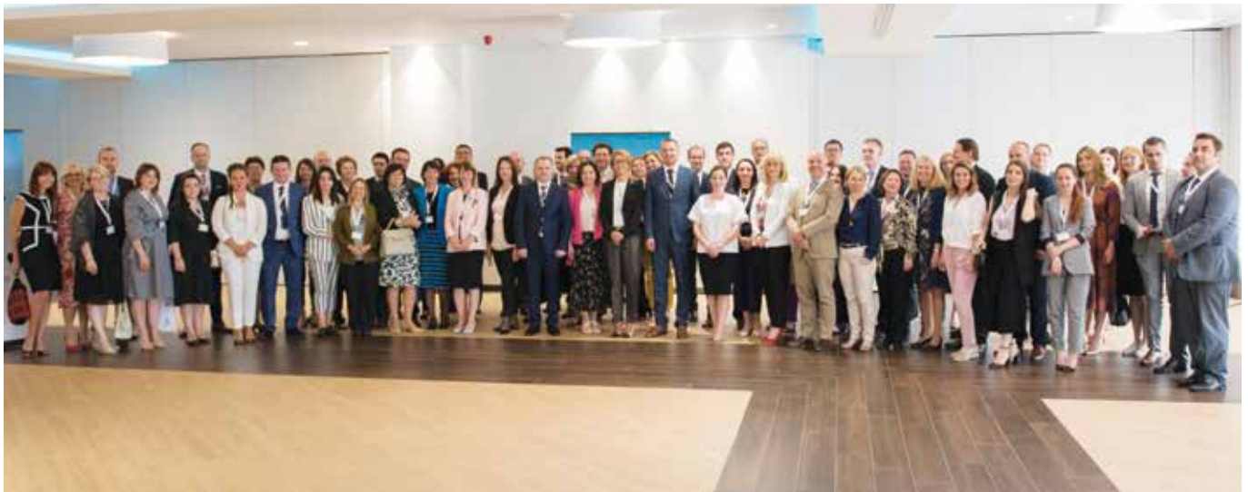
Participants and speakers at the Ministerial Conference in Mostar