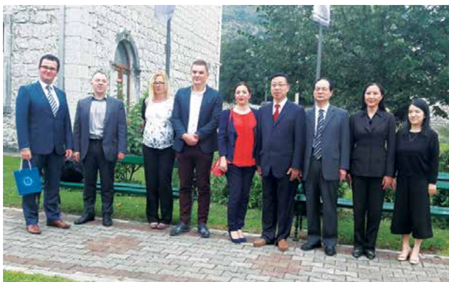
Representatives of the Shanghai Academy of Social Sciences and ReSPA hosts

ReSPA, 27 June 2018 – A delegation from the Shanghai Academy of Social Sciences (SASS) paid an official visit to the ReSPA. This was a return visit of the academic team from the People's Republic of China after the