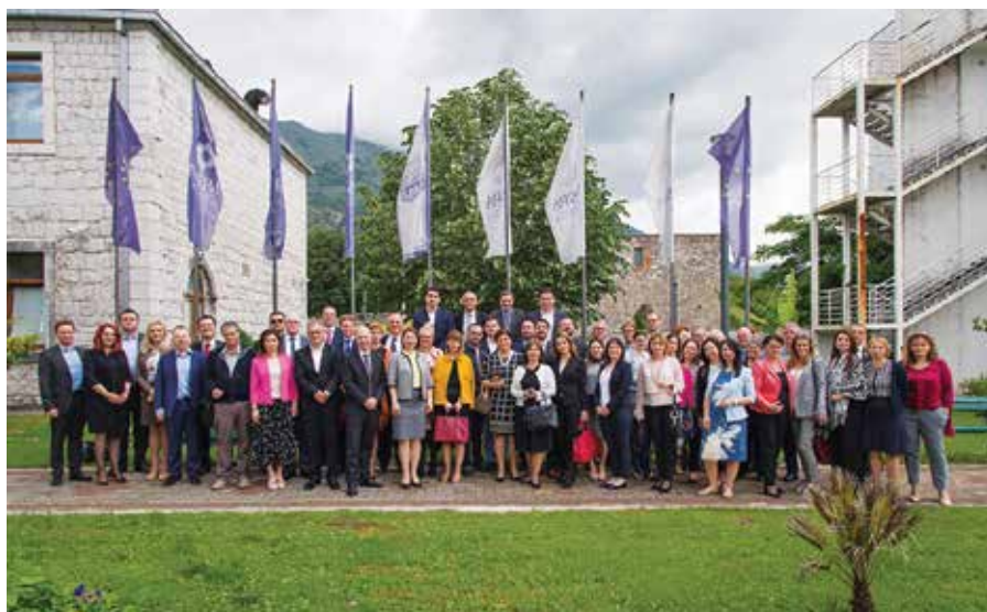
Participants in the SIGMA and ReSPA joint Regional Conference

ReSPA, May 16-17, 2018 - Although Western Balkans EU candidate countries and potential candidates continue to improve their public management as a crucial part of preparations for the EU accession, professionalisation of senior civil servants and managerial accountability remain challenging issues. According to 2017 SIGMA Monitoring Reports 4 , main weaknesses are related to merit-based recruitment and effectiveness of managerial accountability mechanisms. To emphasise the need for support to further reforms for better governance across the Western