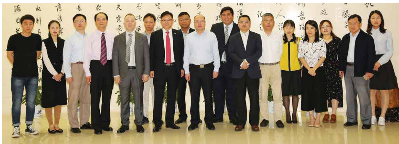
ReSPA representative at the Workshop on Smart City Building in Shanghai

Shanghai, China, 21-23 May 2018 – At the invitation of the Shanghai Academy of Social Sciences (SASS), a representative of ReSPA participated in the workshop entitled "Smart City Building in the New Era: Governance, Sustainability and Culture". The workshop was symbolically organised at the 60th Anniversary of the Shanghai Academy of Social Sciences and the Shanghai Institute of