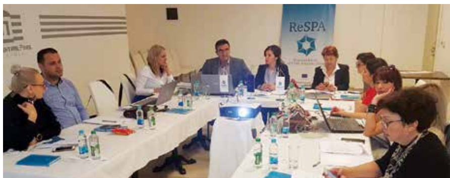
Meeting of ReSPA National Coordinators

During the meeting, special attention was devoted to the discussion on National Coordinators' experience in collecting reports on the implementation of recommendations defined in ReSPA's regional comparative studies. Having in mind the latest conclusion of the Governing Board related to the reports on interconnection between recommendations from ReSPA studies and the