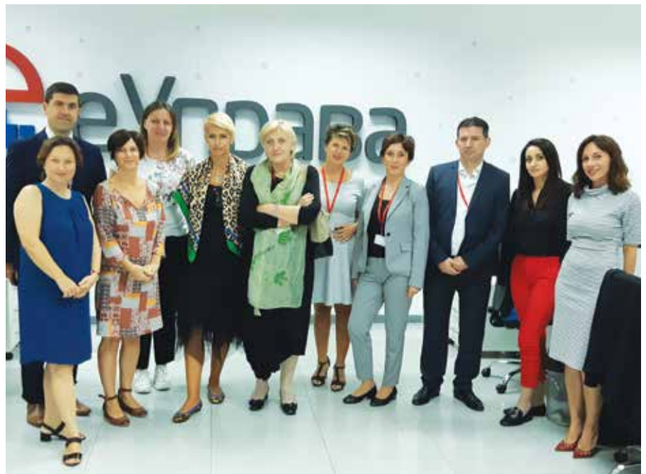
Mobility Scheme: Representatives from Macedonia and Bosnia and Herzegovina visiting counterparts in Serbia

Belgrade, 30-31 August 2018 – ReSPA organised a regional exchange of peer-experience through the Working Visit to the Public Policy Secretariat (PPS), the Office for Information Technologies and e-Government, and the National Academy of Public Administration of the Government of the Republic of Serbia. Participants of the visit were senior public servants from the Ministry of Information Society and Administration from Macedonia, representatives of the Ministry of Justice and General Secretariat of the Council of Ministers of Bosnia and Herzegovina, as well as Assistant Minister of the Ministry of Economic Relations and Regional Cooperation of the Republic of Srpska, and representative of the General Secretariat of the Government of the Federation of Bosnia and Herzegovina, from Bosnia and Herzegovina. This Working Visit was an excellent opportunity