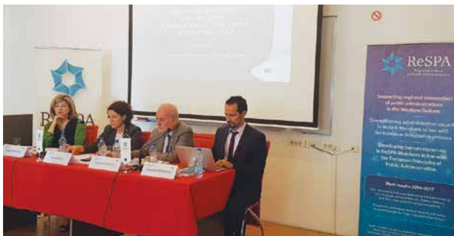
Regional Conference on the Case-Law of the European Court of Human Rights Applicable in Administrative Disputes

Belgrade, Serbia, 17 May 2018 - The overall aim of this Regional Conference was to present the ReSPA's Study on the Case-Law of the European Court of Human Rights (ECtHR) Applicable in Administrative Disputes.