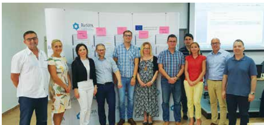
ReSPA Secretariat with CAF experts

ReSPA, 24 July 2018 - Supported by the Centre for Public Administration Research (KDZ) from Austria, a workshop on ReSPA's Common Assessment Framework (CAF) Action Plan was held for the ReSPA Secretariat. This was the first activity envisaged within the BACID 2 (Building Administrative Capacities in the Danube Region) project, that is supported by the Austrian Development Agency (ADA).