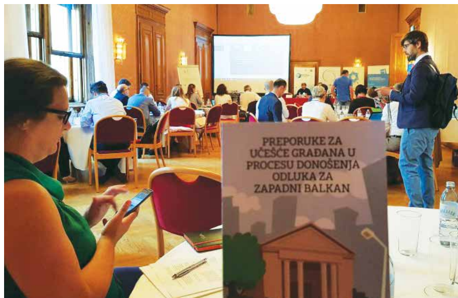
Regional Conference "Unlocking Benefits of Public Participation in the Western Balkans"

A whole set of multilingual public information and awareness raising materials (the Recommendation leaflet, video and brochure) on participation