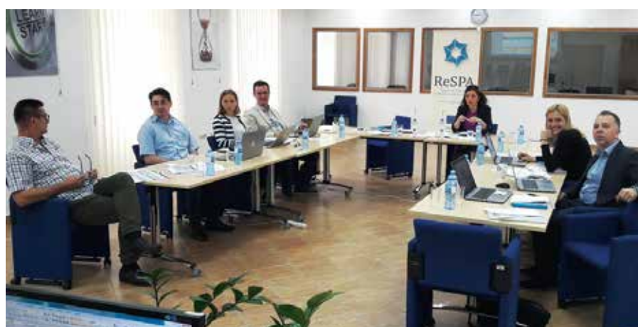
ReSPA Secretariat at the Self-assessment CAF workshop

ReSPA, 8-9 May 2018 - Following the initial Common Assessment Framework (CAF) internal training held in January 2018, a two-day Self-assessment workshop was organised for the ReSPA Secretariat, generating many good ideas on the Organisation's strengths, areas of improvement and actions needed. The Self-assessment workshop was part of a transformation process of ReSPA in domain of institutionalisation of the Common Assessment Framework (CAF) as Quality Management instrument. For that purpose, the ReSPA has designated a team to intensively work on the implementation of CAF and to engage in a discussion on internal