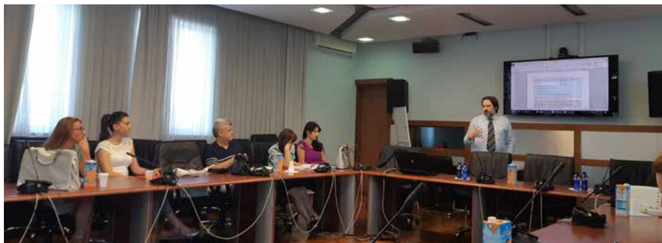
ReSPA Supports Trainings in Regulatory Impact Assessment