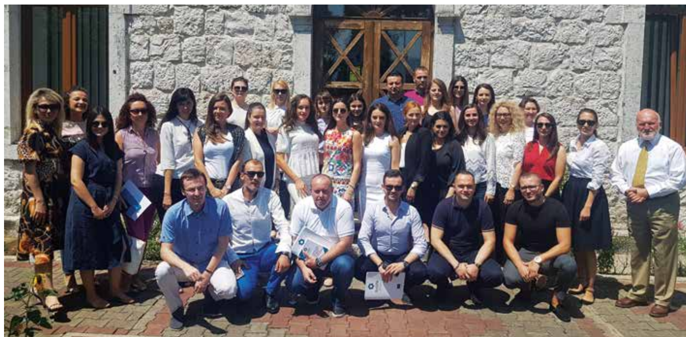
Participants in the 2018 ReSPA Summer School

ReSPA, 2-6 July 2018 - The Regional School of Public Administration (ReSPA) held its second, five-day Summer School on Accession Negotiations with the European Union (EU), with a special focus on Chapters 23 (Judiciary and Fundamental Rights), and 24 (Justice, Freedom and Security).