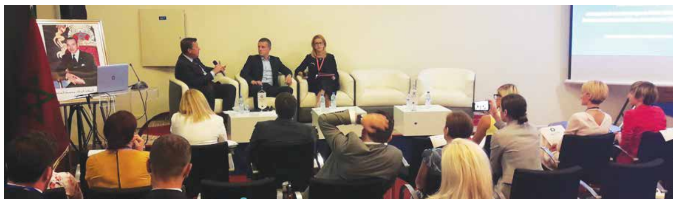
Participants in ReSPA's Panel at the 2018 UN Public Service Forum

ReSPA contributed to the 2018 UN Public Service Forum with a panel session entitled “Achievements and Challenges in Public Administration - Reform in the Western Balkans to fulfil the 2030 Agenda”, in the context of Introduction of the Global Initiative and Regional Perspectives on Public Administration Readiness for the 2030 Agenda. Participants in the panel were distinguished representatives of the Western Balkan administrations, respective experts and discussants in the subject, and a representative of the SIGMA/OECD.