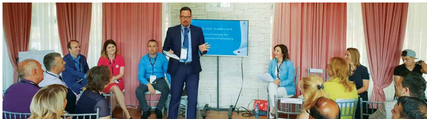
ReSPA Panel at OGP Summit

Tbilisi, Georgia, 17-19 July 2018 – The guiding objective of the 5th Open Government Partnership 1 Global Summit was to explore and exchange the ideas on how to make governments more responsive to citizens, and how to empower people to take more active role in decision-making processes.