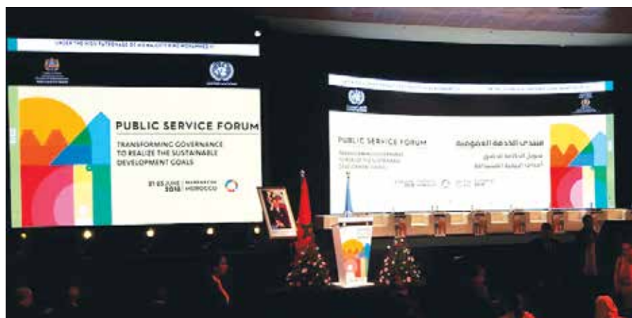
The 2018 United Nations Public Service Forum

Marrakesh, Morocco, 21- 23 June 2018 – This year's United Nations Public Service Forum provided an opportunity for policy-makers to exchange good practices, experiences and lessons learned through collaboration and networking to improve